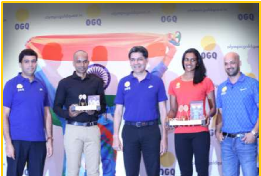
OGQ felicitation of PV Sindhu and P. Gopichand.