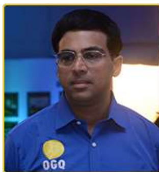
Viswanathan Anand 5 times Chess World Champion