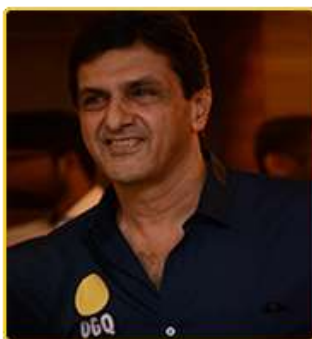
Prakash Padukone All England Badminton Champion