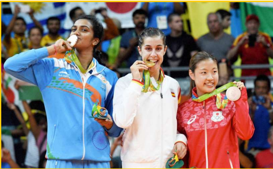
PV Sindhu wins the Silver medal at Rio 2016 Olympics.