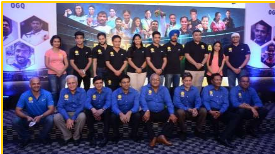
OGQ Board and athletes at an event in Mumbai.