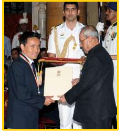
Olympic finalist Jitu Rai receiving the Khel Ratna award.