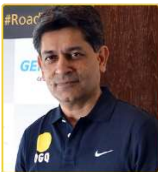
Geet Sethi 9 times World Cue Sports Champion