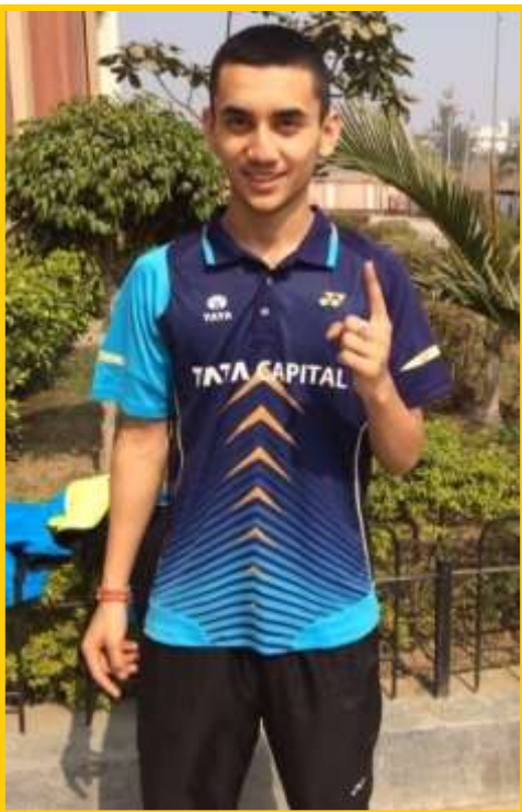
Badminton player Lakshya Sen became the World No. 1 Junior player.