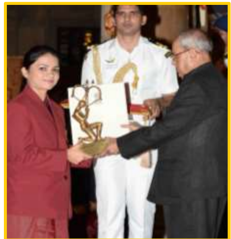
Olympian Shooter Apurvi Chandela receiving the Arjuna Award.